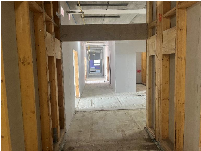
Corridor Space – first floor