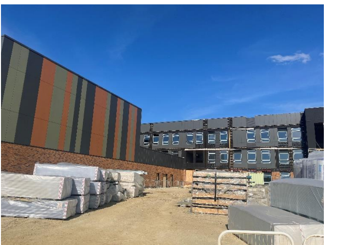
Rear of Teaching Block/Sports Hall