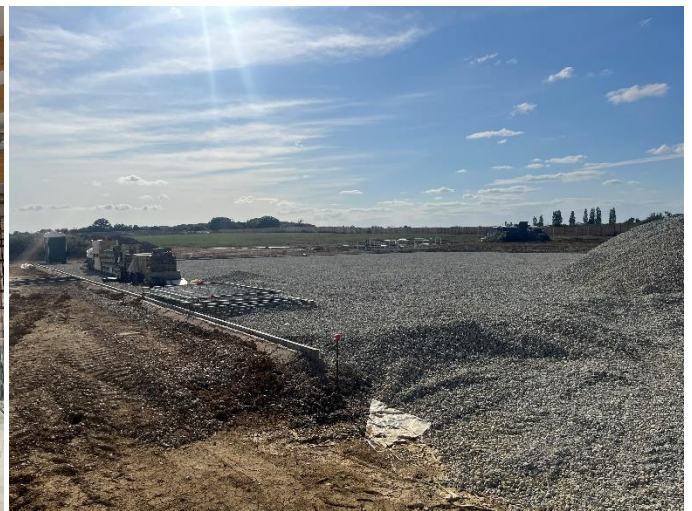
Mixed Use Games Area – Surfacing