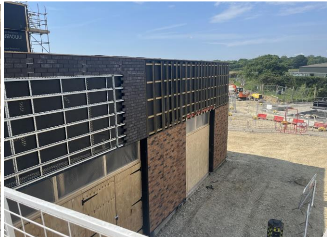
Exterior Appearance of Building