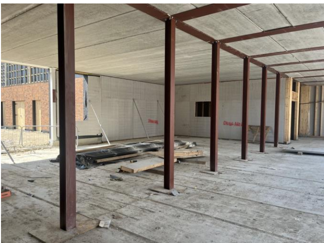
Dining Hall looking towards Sports Hall

We most recently visited the site on Monday 20 th May and saw the continued and rapid progress that the school is making. The structure of the Sports Hall is now in place and the main teaching block has made significant progress since our last visit.