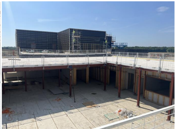
View from second floor over Dining Hall