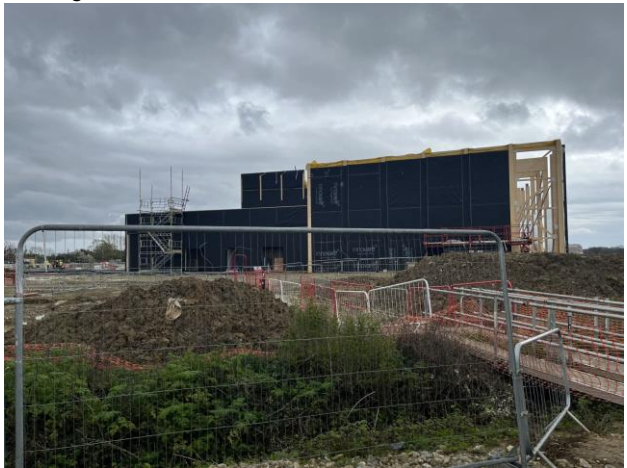
Sports Hall Structure