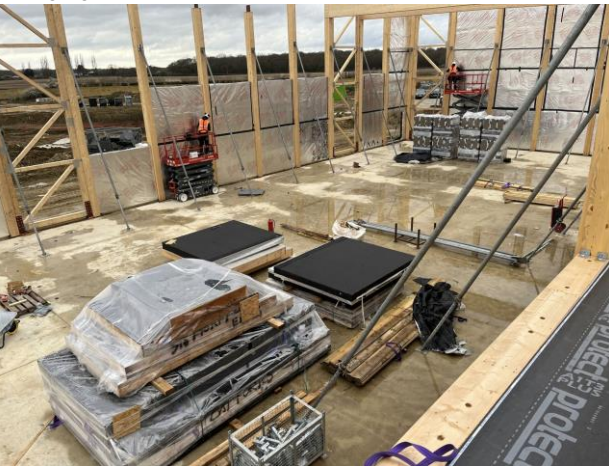
Sports Hall from above the Dance/Drama Studio

Significant progress has been made on our permanent home over the last few weeks. Much of the cooling labyrinth that will sit underneath the school structure is now complete. If you have passed the site over the past week or so, you will have seen the frame for our new sports hall rapidly nearing completion. Over the coming months, this will be joined by the emerging structure of the main school building.